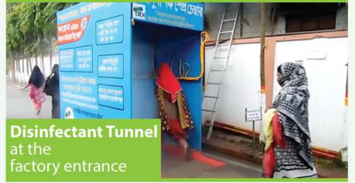
Disinfectant Tunnel at the factory entrance