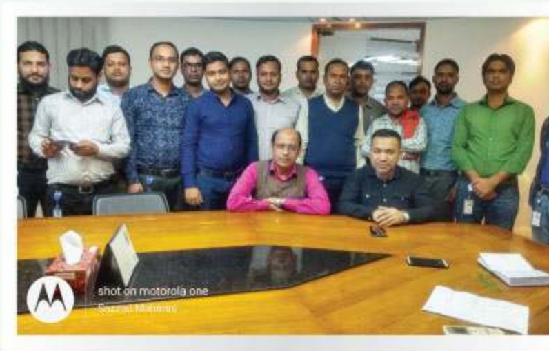
Training on Presentation Skill