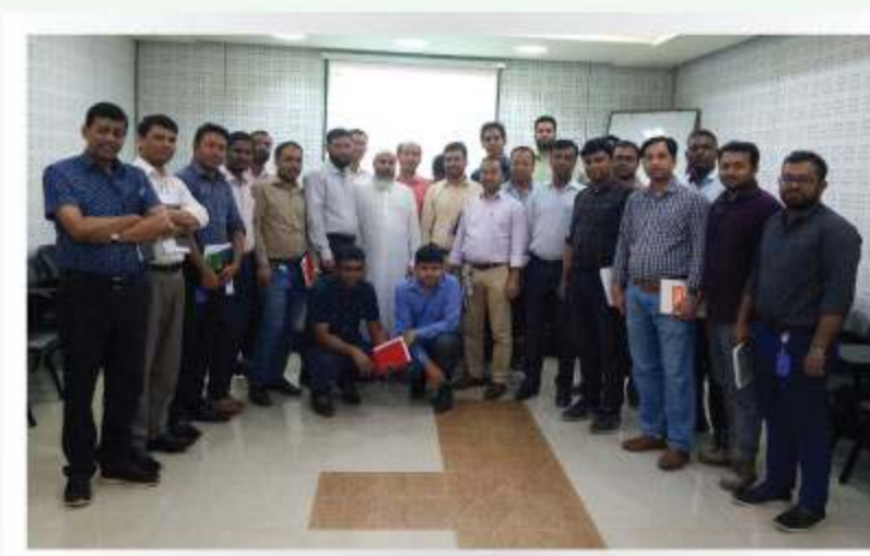
Training on Seven Habits of Highly Effective People