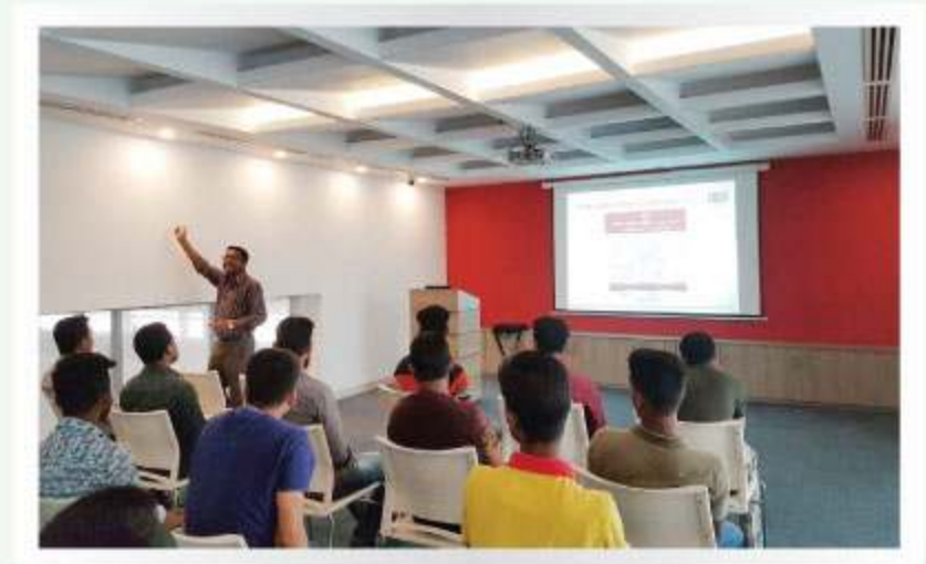
Training on Protection from Coronavirus