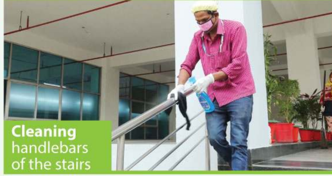
Cleaning handlebars of the stairs