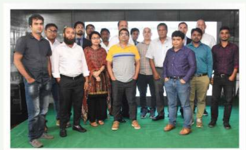
Training on Zero Discharge