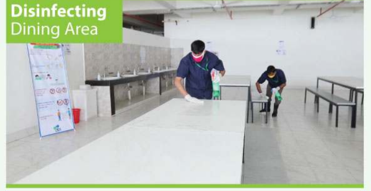
Disinfecting Dining Area