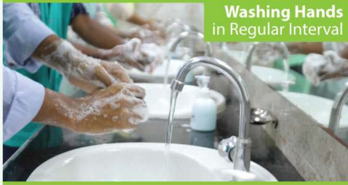
Washing Hands in Regular Interval