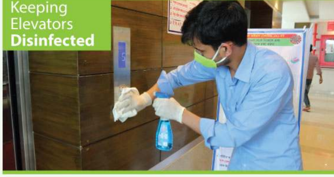
Keeping Elevators Disinfected