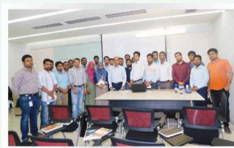
Training on Self Development