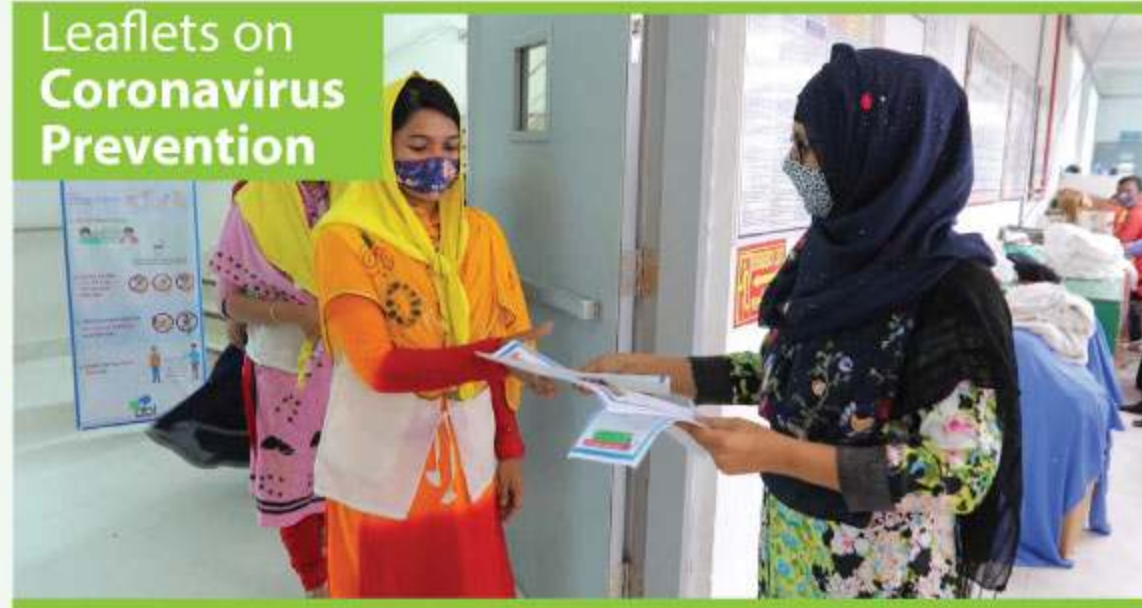
Leaflets on Coronavirus Prevention