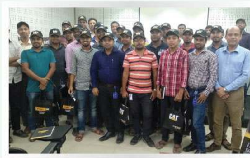
Training on Generator Maintenance