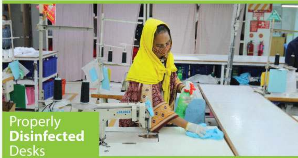
Properly Disinfected Desks

On 8 March 2020, when the first case of Coronavirus was detected in Bangladesh; from that point of time we became careful for our people and took adequate measures at our factory complexes. Hand washing while entering the factory and using masks at all areas inside the factory was made mandatory. Disinfectant Tunnels were established at the factory entrances. Also, we regularly disinfected places in factory that comes in contact with our hands.