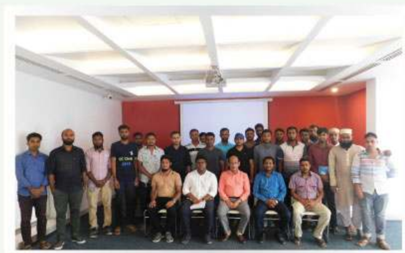
Training on Quality Control Circle