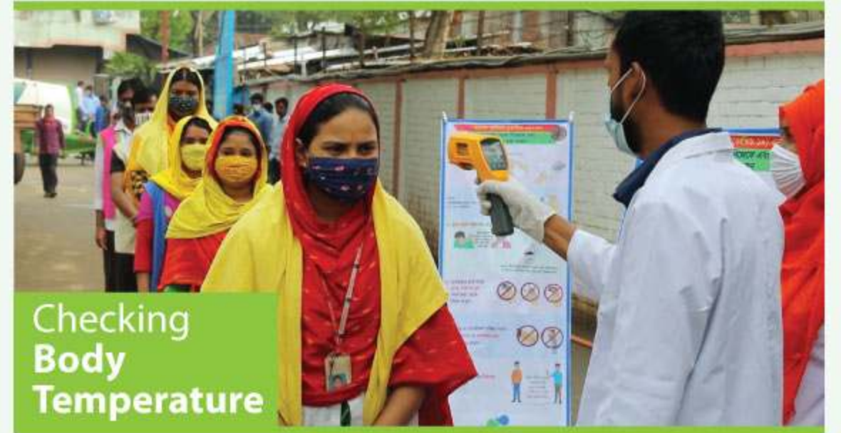
Checking Body Temperature