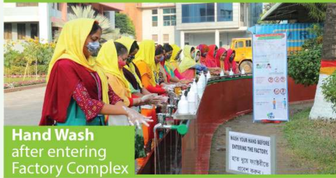
Hand Wash after entering Factory Complex