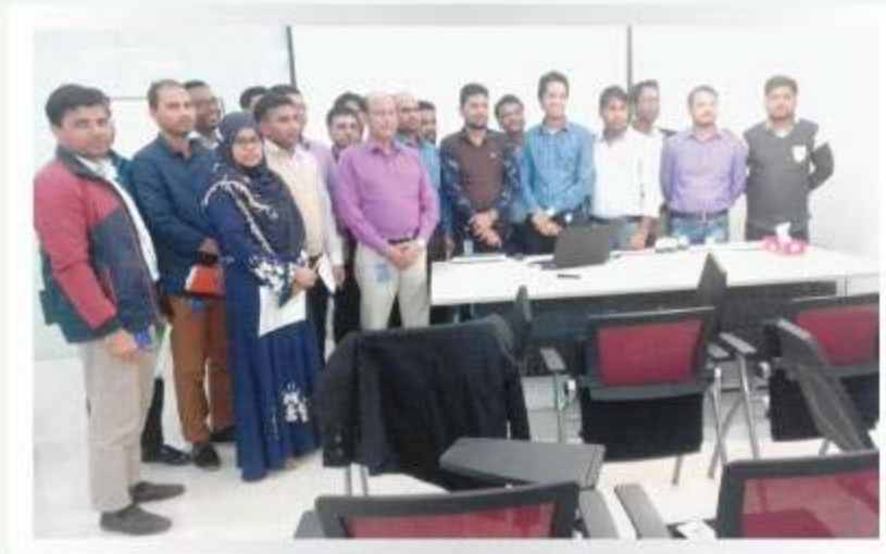
Training on Effective Communication

DBL Group considers its employees as a resource for the organization. The Management of DBL Group always encourages its employees to attend different training programs at home and abroad. This journey of developing employee skills by providing them scopes to attend in-house, institution based, local and overseas trainings, workshops, conferences has been continuing for a long time. Here, we are presenting a glimpse of some of the training sessions attended by DBL employees in recent past.